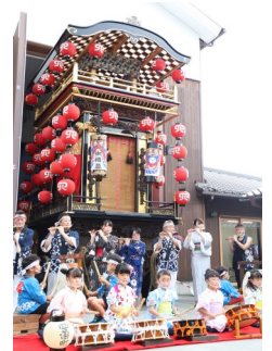
やま 山車 - Yama